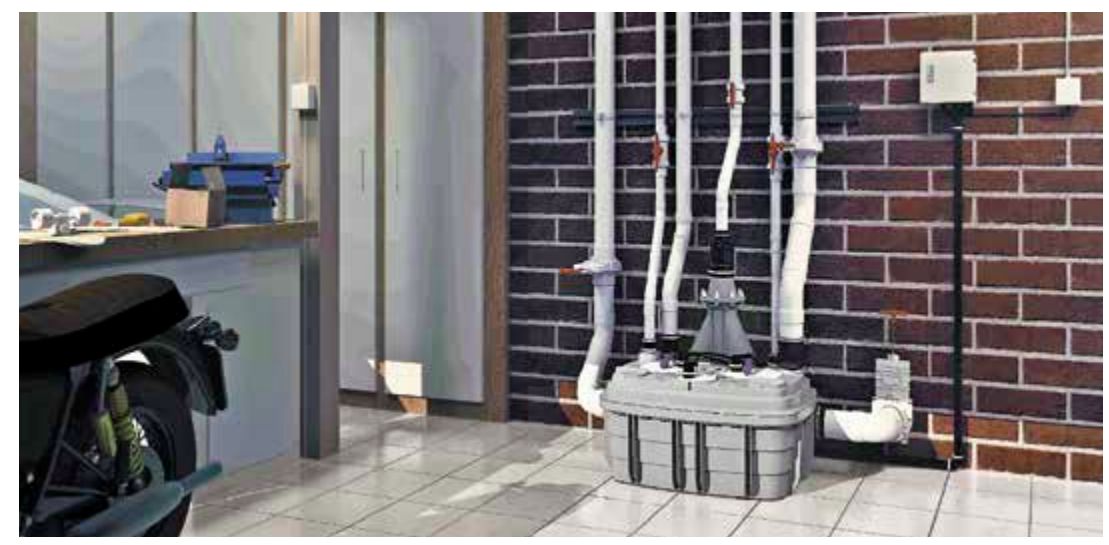
Example of installation. Follow local plumbing codes for actual install.